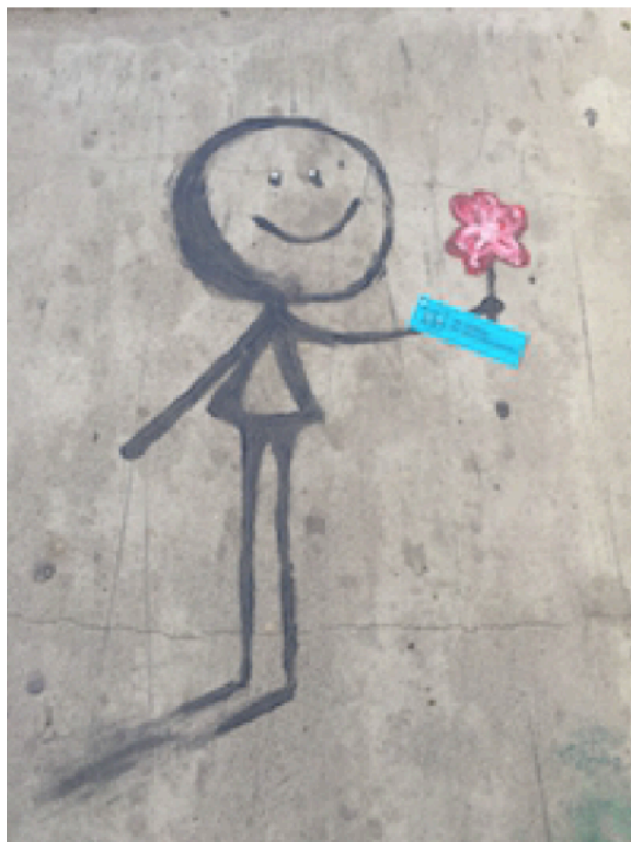
"No school, no skateboarding" sticker on a wall in Heidelberg.