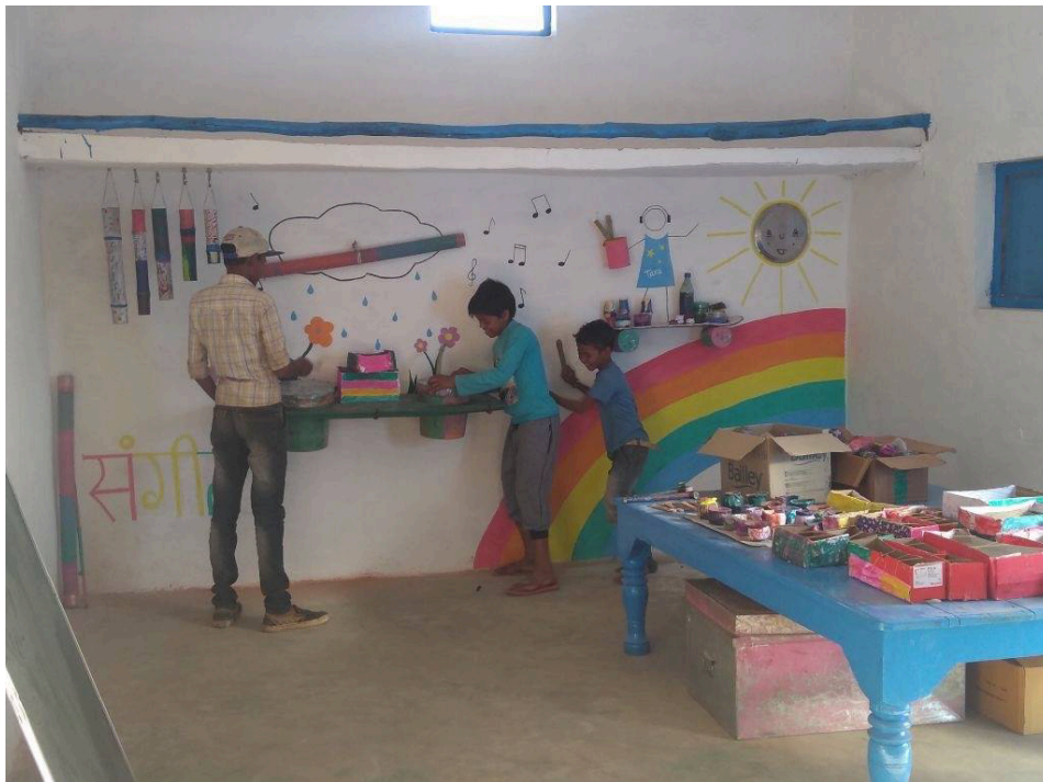
The music wall is in the making

The home stays are bed & breakfast accommodations for visitors to the village, set up by some family as part of our on-site activities and run independently by the villagers. The same is true for a bicycle rental service newly established in the village.