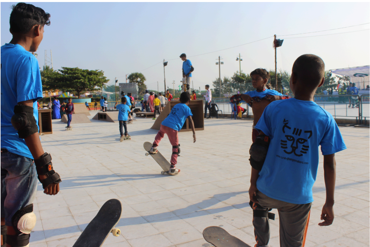
"Les Bleus" in action

The competition was divided into three age groups (8-12 years; 12-16 and over 16 years) and separated by boys and girls. All in all, 63 children participated and 18 medals were awarded. In all competitions in which Janwaar Kids competed, they won, i.e. they won the gold medal and 4 silver/bronze medals. A real shower of medals!