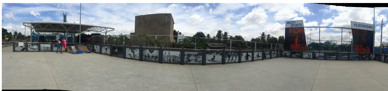
Advertising in the outdoor area of Decathlon India Headquarters

A special form of public relations has emerged over the years with our partner Decathlon Skateboarding. In their Indian headquarters in Bangalore (store and office, Airport Road) the different videos about our Rural Changemakers are running on the in-store screens and in the outdoor area our story is told on the board of their skatepark.