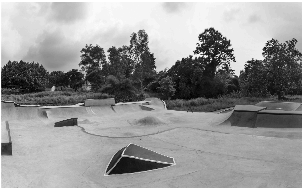
Panoramic view of the skatepark

Ulrike Reinhard has been active in Janwaar, Madhya Pradesh, central India since 2014. With the help of 12 volunteers from seven different countries, she built the first skatepark in a rural village in India. The project was defined as an experiment and the central question was: does this skatepark have the power to "disrupt" the village in a way that its inhabitants, especially the children "move" and change becomes possible?