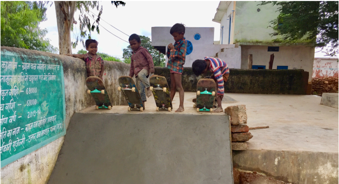
The mini skatepark adjacent to the villa