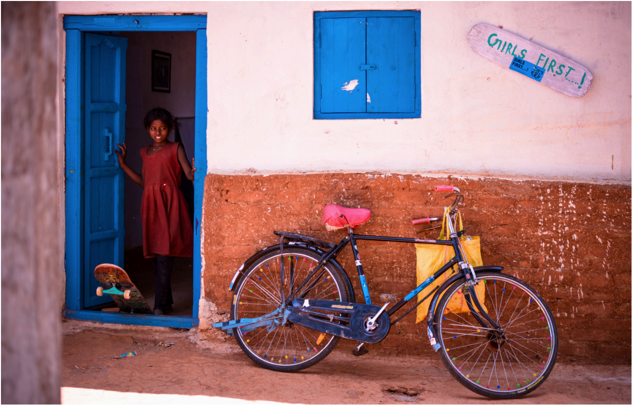
Entrance Villa Janwaar